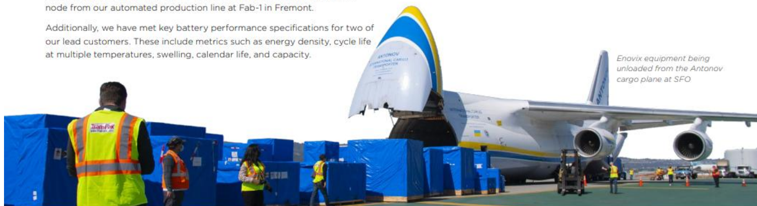
Enovix equipment being unloaded from the Antonov cargo plane at SFO

With the equipment for Line 1 installed, our factory is now undergoing qualification. The first step in this process is a site acceptance test to confirm the individual pieces of equipment are meeting performance requirements. This follows factory acceptance testing already performed at the vendor's facility before taking delivery. The second step is a characterization process, or tool and process bring-up. This is a rigorous phase gate process developed and effectively used by several of our strategic partners and members of our management team to successfully scale up multiple high-volume production factories. To lead this effort, we have added Boris Bastien as Vice President of Operations to our executive management team. Bastien's most recent position was General Manager of SunPower's Fab4 in the Philippines.