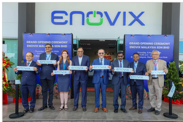
Enovix Malaysia Fab2 Grand Opening Recap

We formally opened Fab2 in Malaysia with various stakeholders including several leading smartphone OEMs that provided decidedly positive feedback on ramp quality and speed, as well as the level of automation. A total of 11 customers have now inspected our new facility. The Agility Line is fully operational with initial yields comparable to final levels we achieved with our first manufacturing line in California, with expected improvements on the horizon. Consistent with our plans, we commenced shipping EX-1M cells to customers in the third quarter, supporting their qualification and mass production timelines. We are on track to complete Site Acceptance Testing (SAT) of the High-Volume Line in Q4 2024.