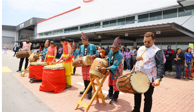
Enovix Fab2, Penang Malaysia