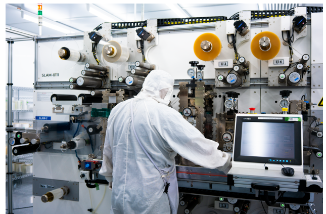
Enovix Fab2 Agility Line